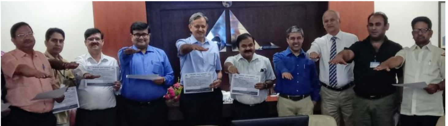
TWG Members while taking a pledge against Hepatitis B & C

For more information log on to : https://theempathycampaign.com/twg-members-2/ or CLICK HERE